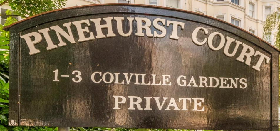
Pinehurst Court Colville Gardens, Notting Hill, W11