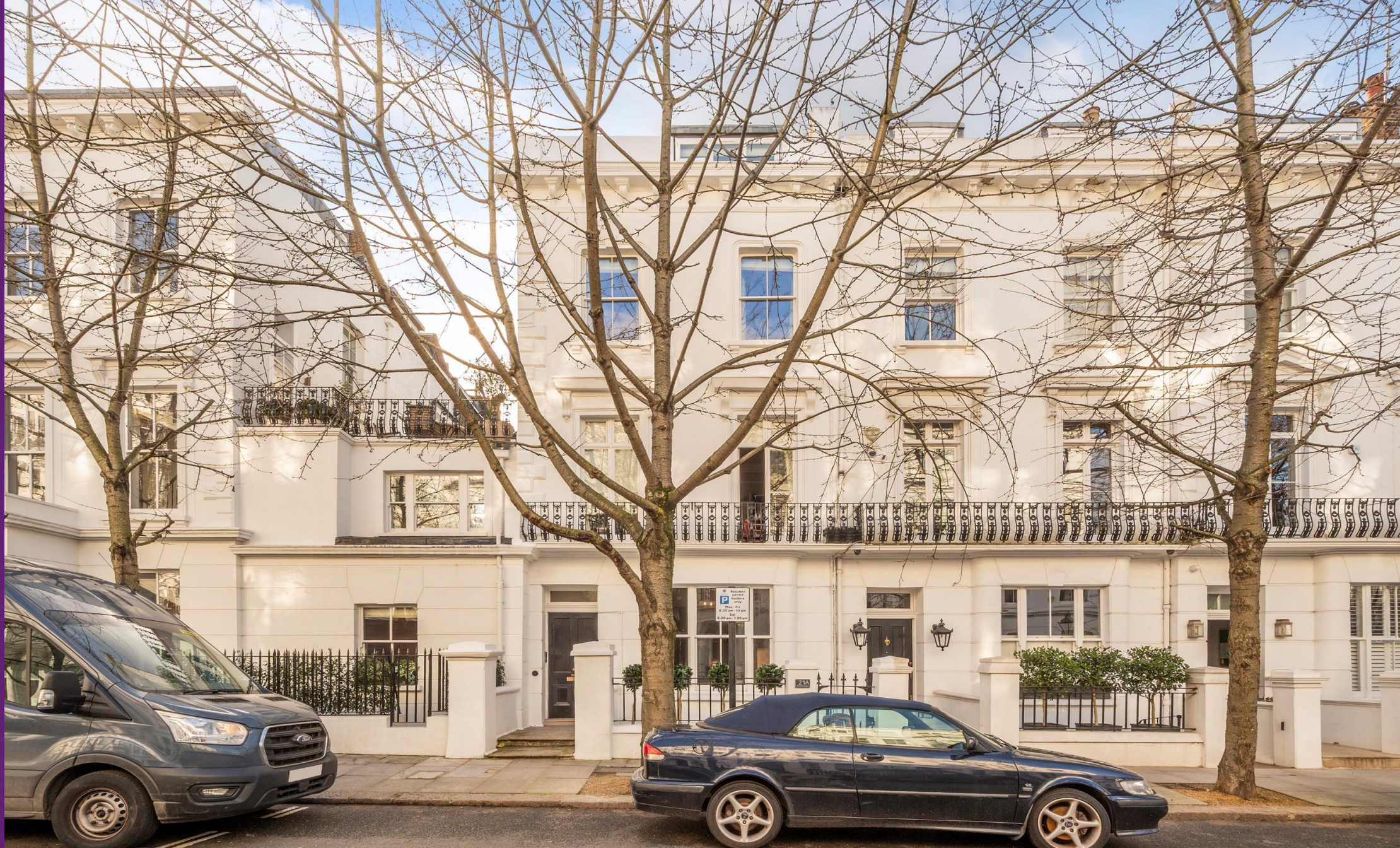
Brunswick Gardens Kensington, W8