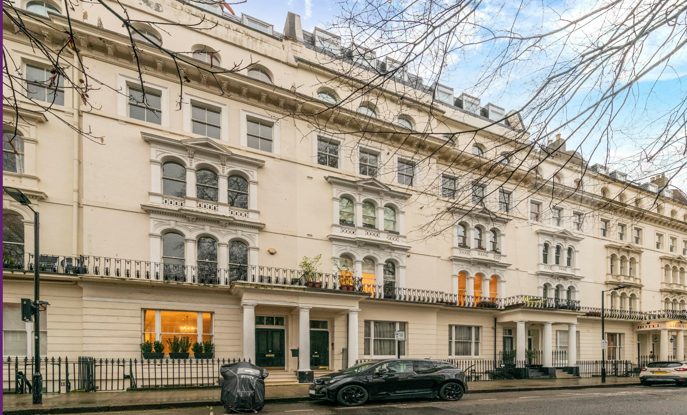
Kensington Gardens Square Notting Hill, W2