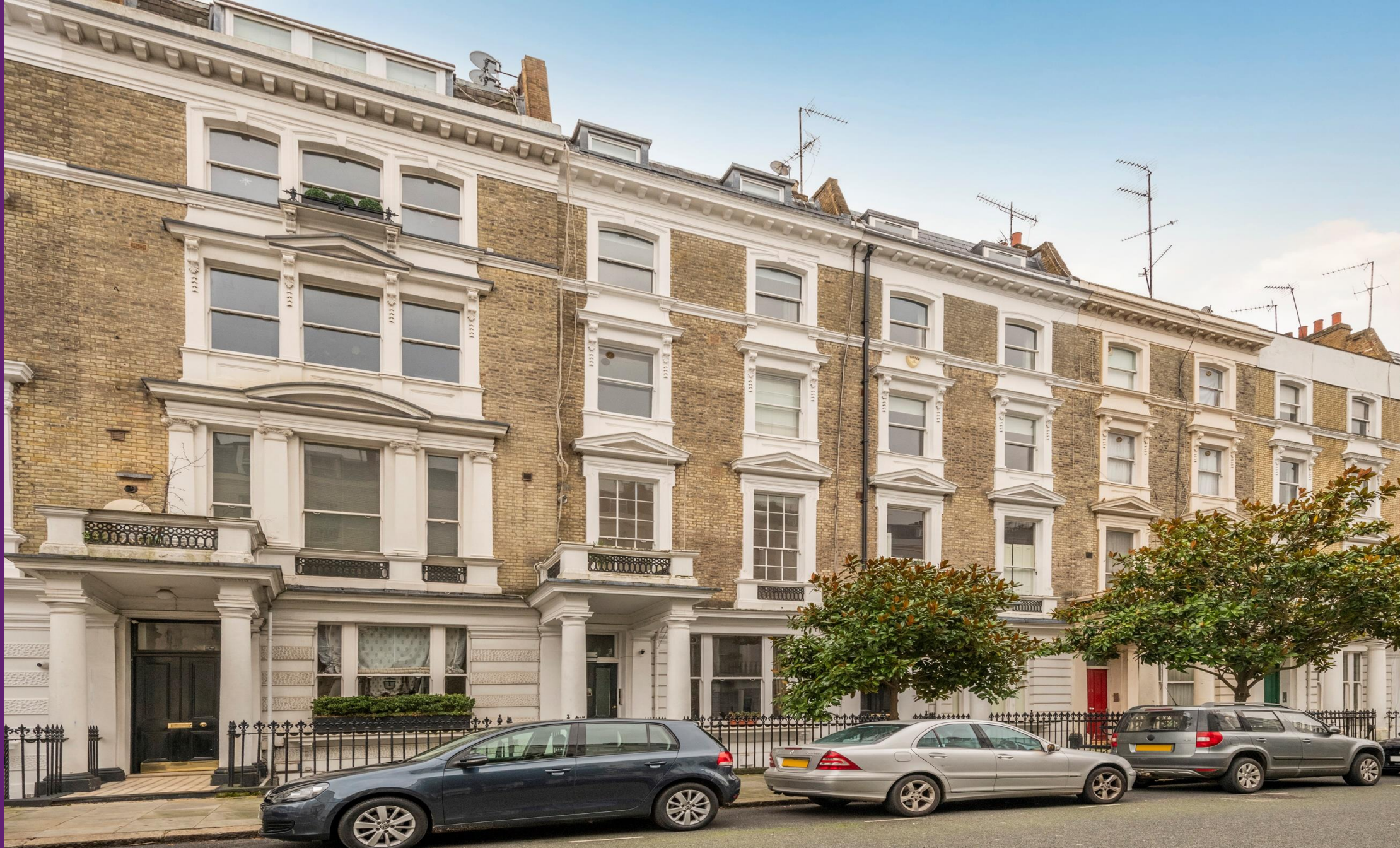
Arundel Gardens Notting Hill, W11