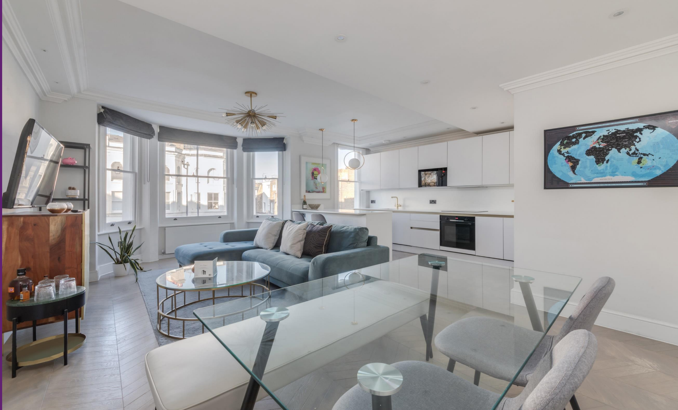
Colville Terrace Notting Hill, W11