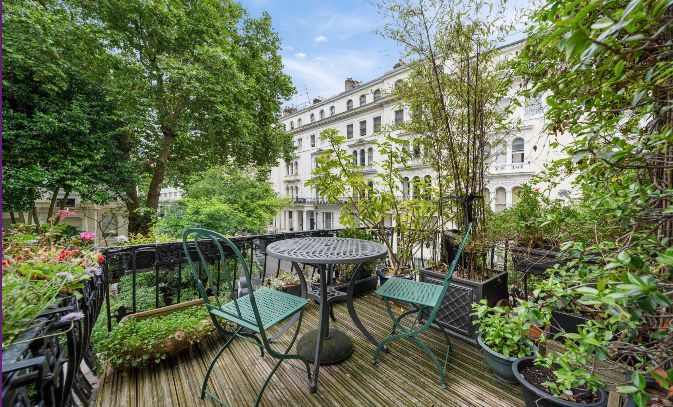
Kensington Gardens Square, Notting Hill, W2