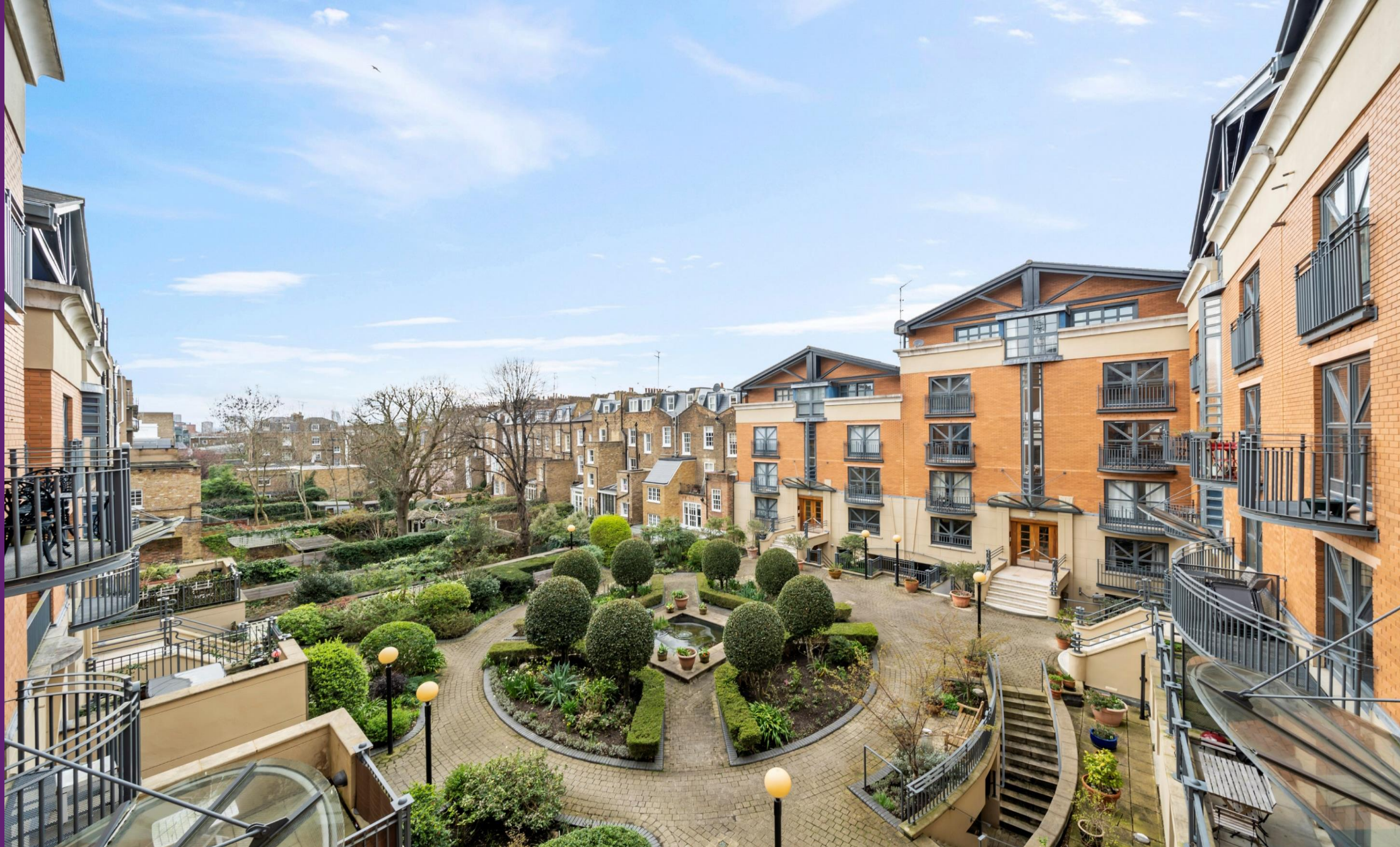
The Westbourne, Artesian Road Notting Hill, W2