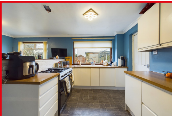
KITCHEN/ DINING AREA

Spacious lounge with a wallpapered feature wall accompanied with neutral décor. Plenty of space for furniture in this large room with open views to the front. Carpeted floor area.