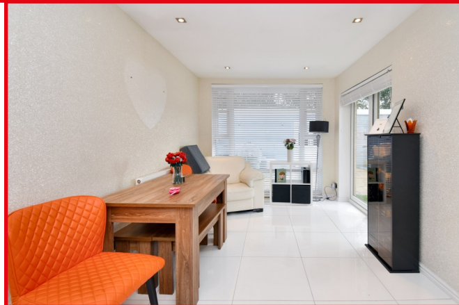
Dining Room / Extension

Spacious lounge with triple window formation to the front allowing plenty of light into the room. Feature wall with integrated gas fire and space for a TV. Contemporary décor and laminate flooring. Plenty of space for furniture in this lovely room which is ideal for relaxing or entertaining.