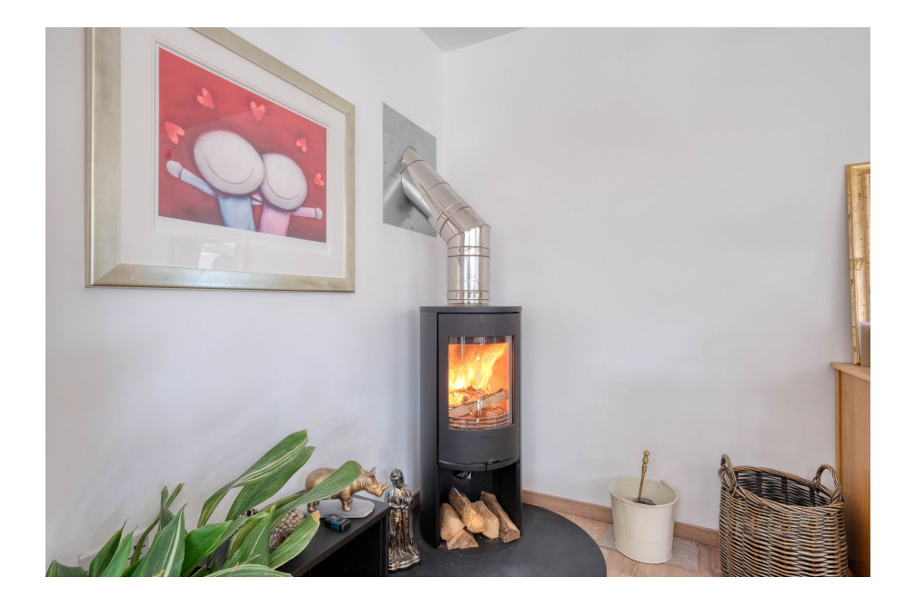
Grassmoor Road, Kings Norton