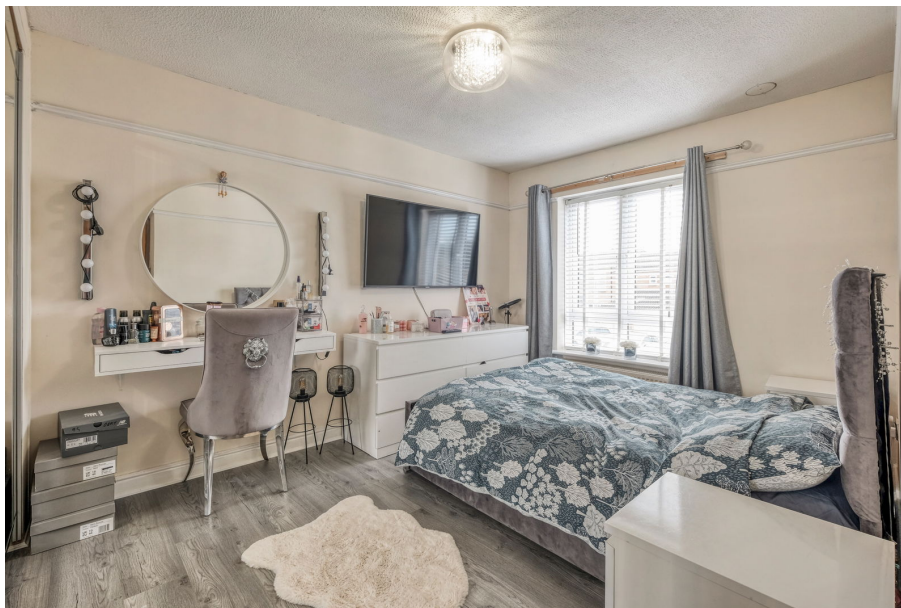
Titania Close, Rednal Ground Floor