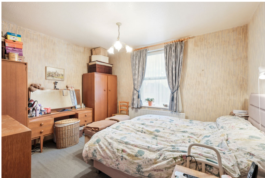
Rednal Hill Lane, Rubery, Birmingham Ground Floor