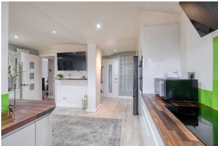
Coombes Lane, Longbridge, Birmingham Ground Floor