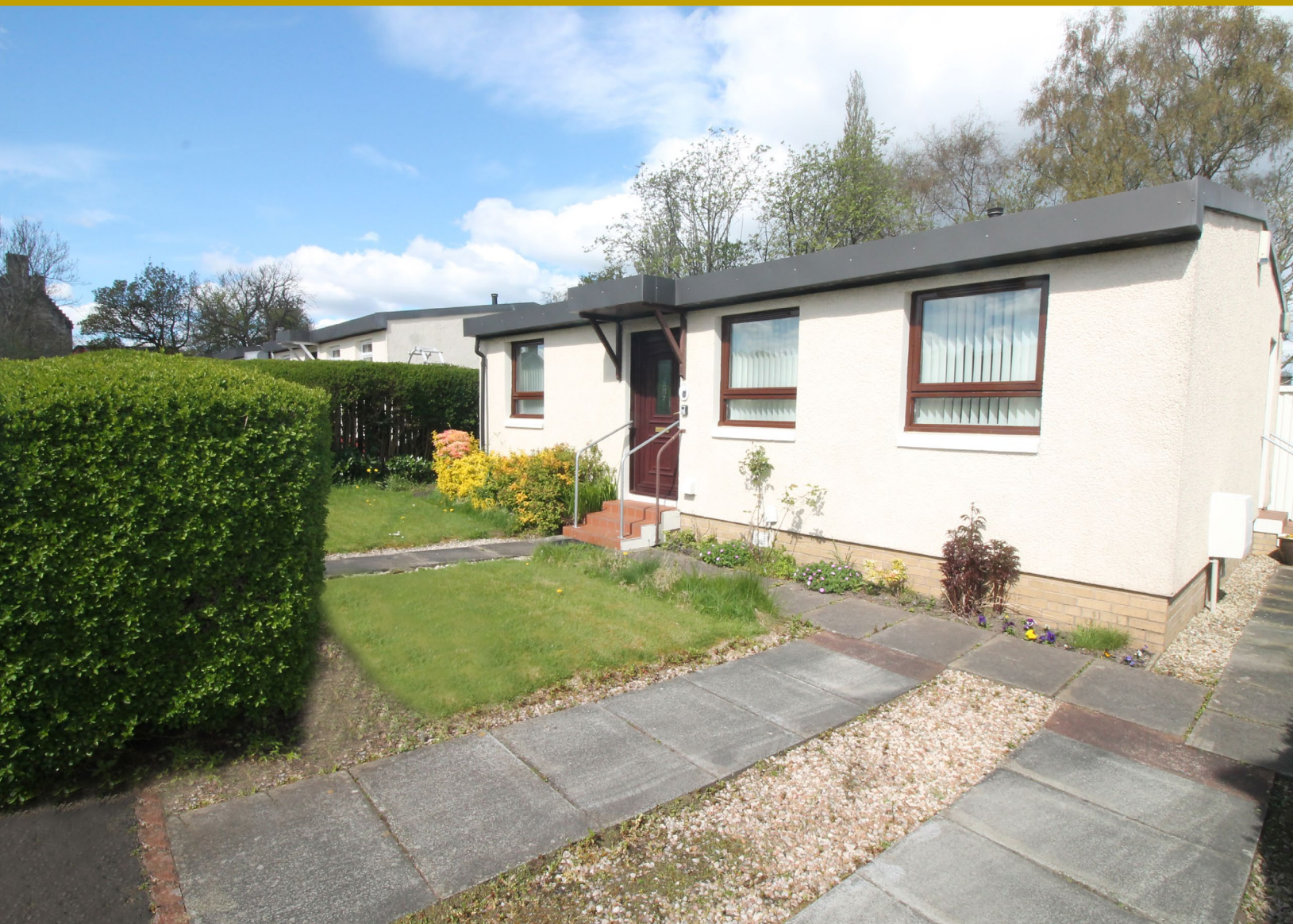
13 Weaver Terrace Paisley