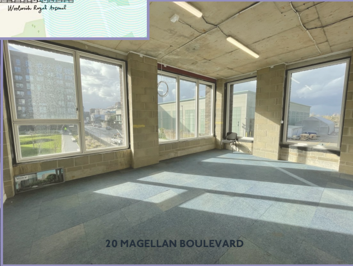
20 MAGELLAN BOULEVARD