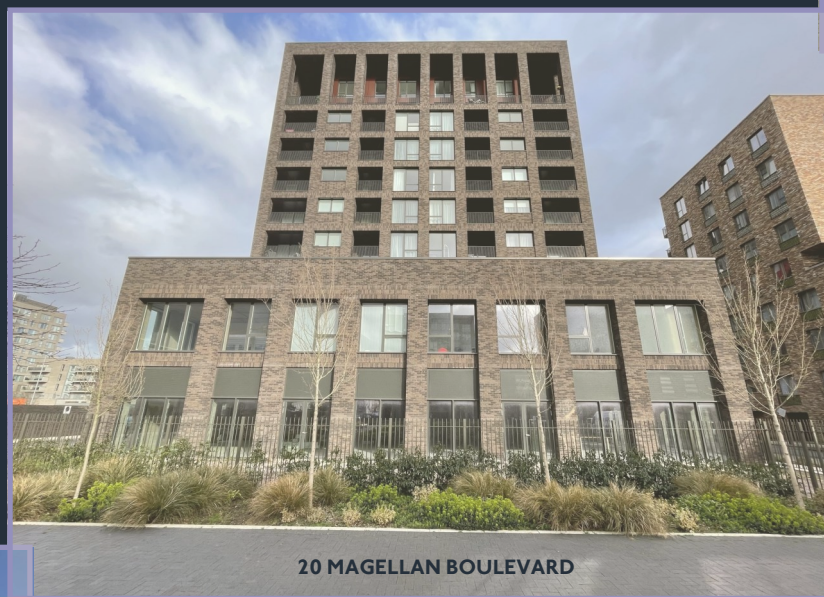
20 MAGELLAN BOULEVARD