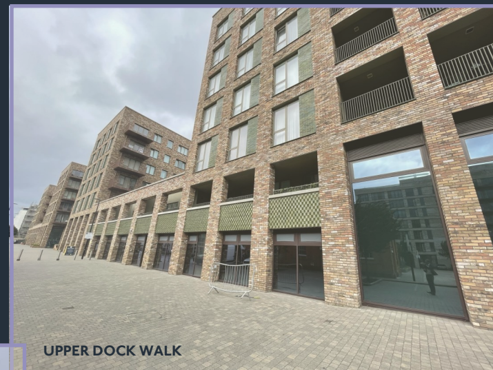
UPPER DOCK WALK