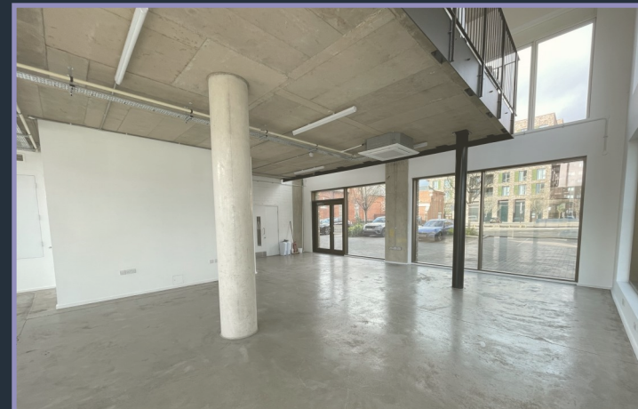
17-18 LOWER DOCK WALK