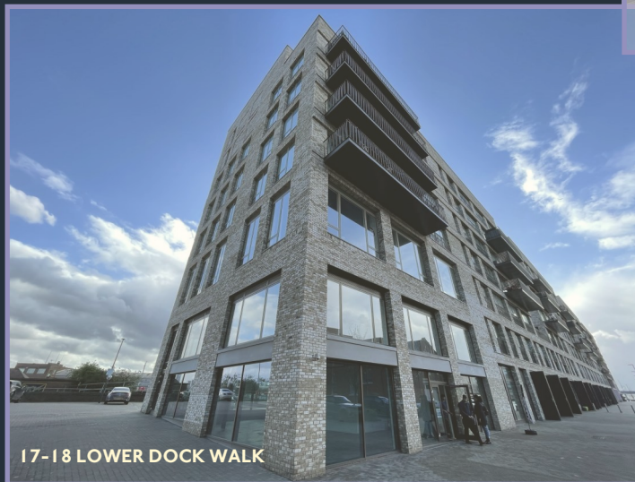
17-18 LOWER DOCK WALK

* BUSINESS RATES WILL BE ASSESSED FOLLOWING OCCUPATION. WE RECOMMEND TENANTS CARRY OUT FURTHER RESEARCH