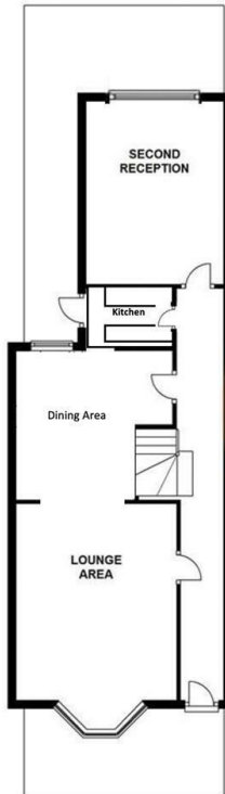
GROUND FLOOR APPROX. 61.5 SQ. METRES (661.9 SQ. FEET)