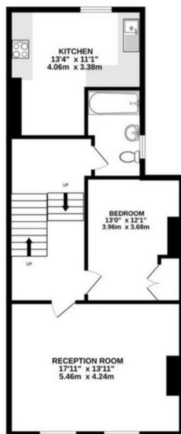
First floor 720 sq ft. (66.9 sq.m.) approx.