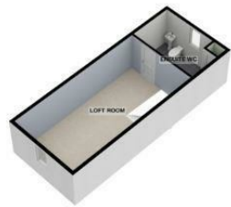
1ST FLOOR 305 sq.ft. (28.3 sq.m.) approx.

TOTAL FLOOR AREA : 1054 sq.ft. (97.9 sq.m.) approx.