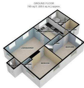
GROUND FLOOR 749 sq.ft. (69.6 sq.m.) approx.