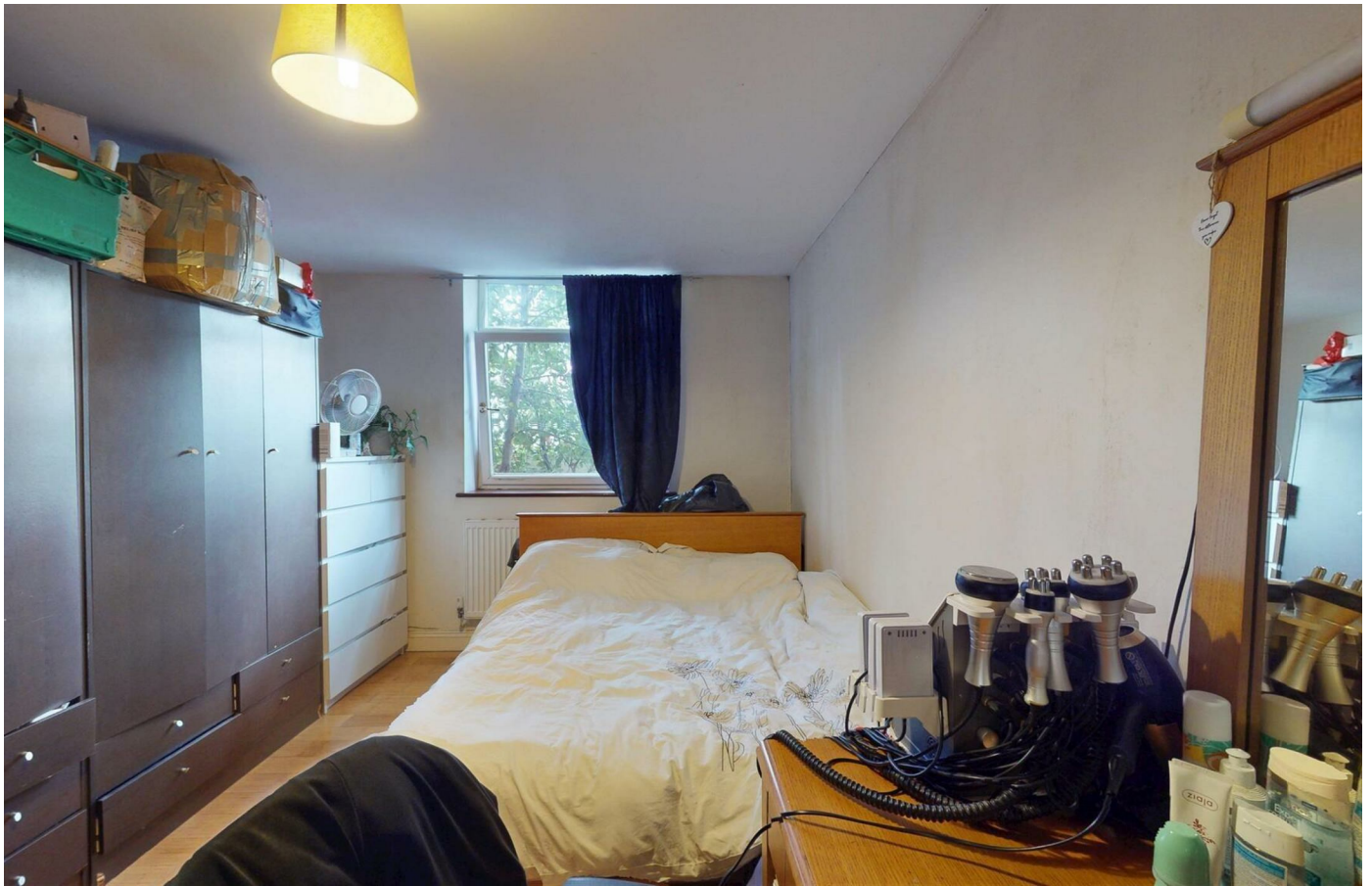
5 Laugan House Laugan Walk, London, SE17 2EA