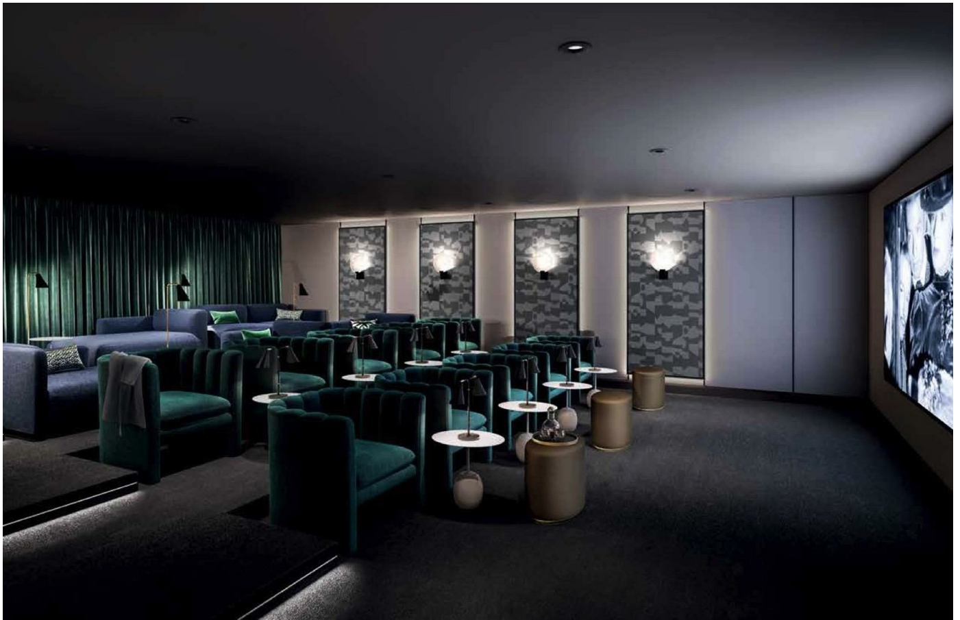
Flat 6003 2 Eden place, Canning Town, London, E16 1DD