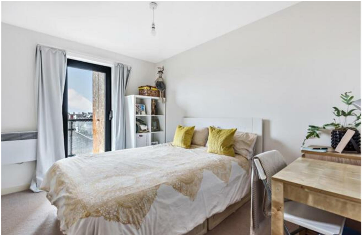
Flat 29 Kitchen Court 6 Brisbane Road, London, E10 5N7