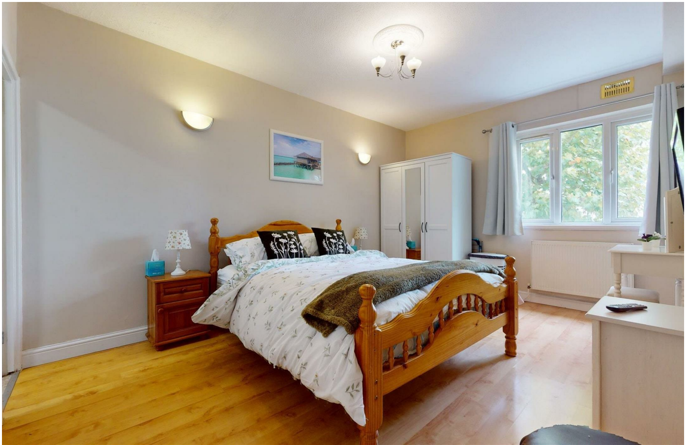
Flat 15 Oak Tree Lodge 49-50 Leinster Gardens, London W2 3AT