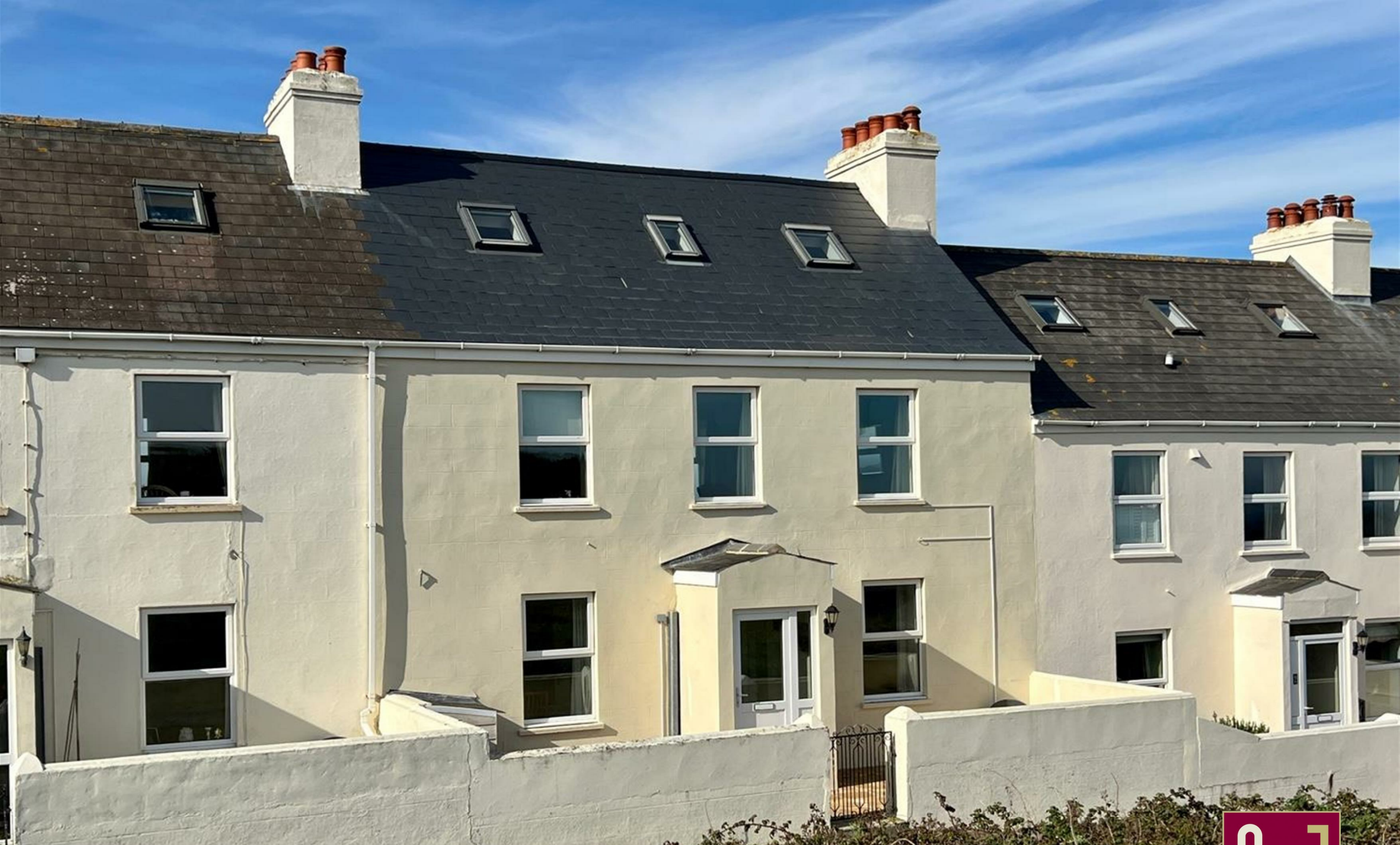
Simons Place, Alderney