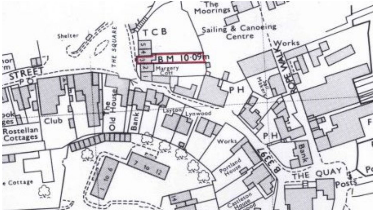
For identification purposes only. Not to scale and not to be relied upon.

VIEWING & FURTHER INFORMATION: CALL 023 8022 2292