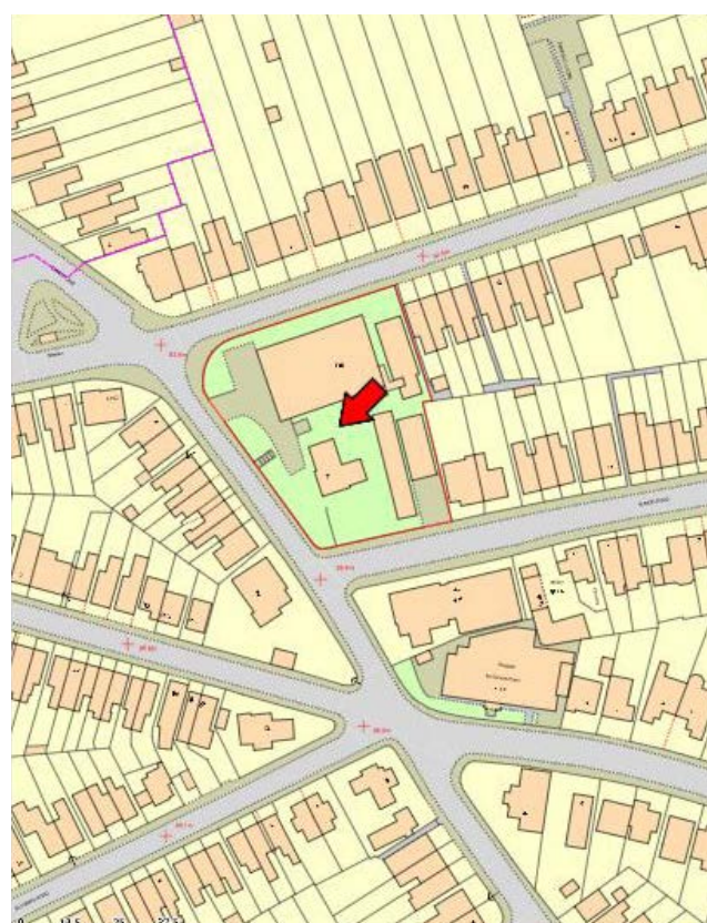
These are not to scale and are shown for indicative purposes only.