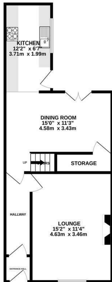
GROUND FLOOR 472 sq.ft. (43.8 sq.m.) approx.