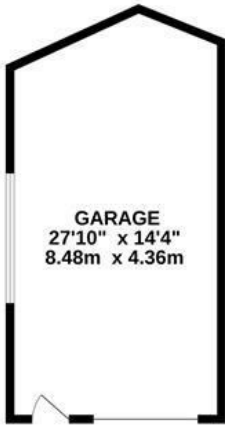
GROUND FLOOR 832 sq.ft. (77.3 sq.m.) approx.