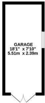
GROUND FLOOR 701 sq.ft. (65.1 sq.m.) approx.