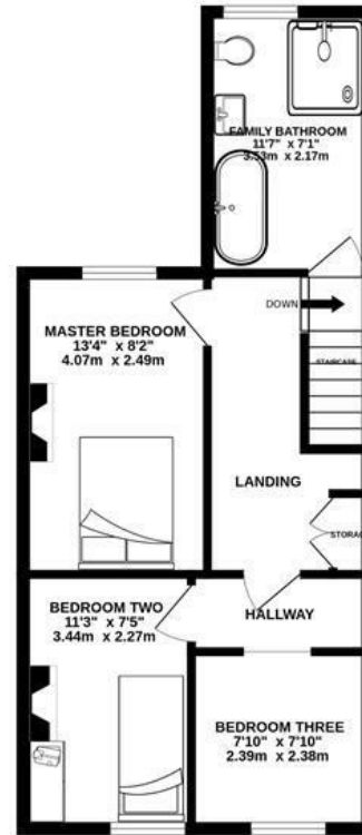
1ST FLOOR 451 sq.ft. (41.9 sq.m.) approx.