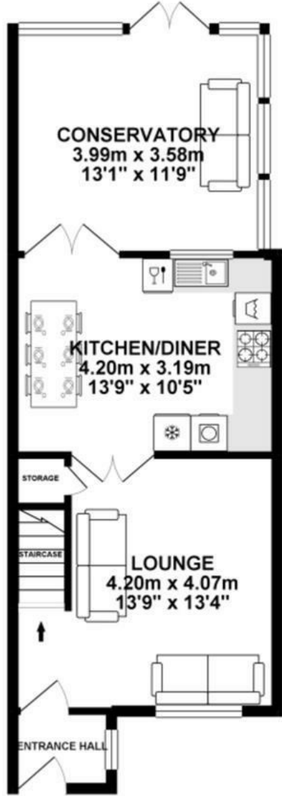
GROUND FLOOR 46.67 sq. m. ( 502.33 sq. ft. )