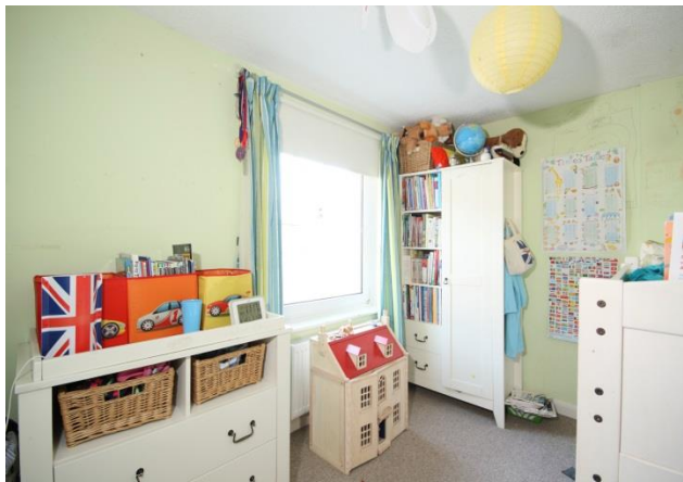
Hawkins Cottage, 12a Church Street, Market Lavington, SN10 4DT Total Area: 106.0 m 2 ... 1141 ft 2