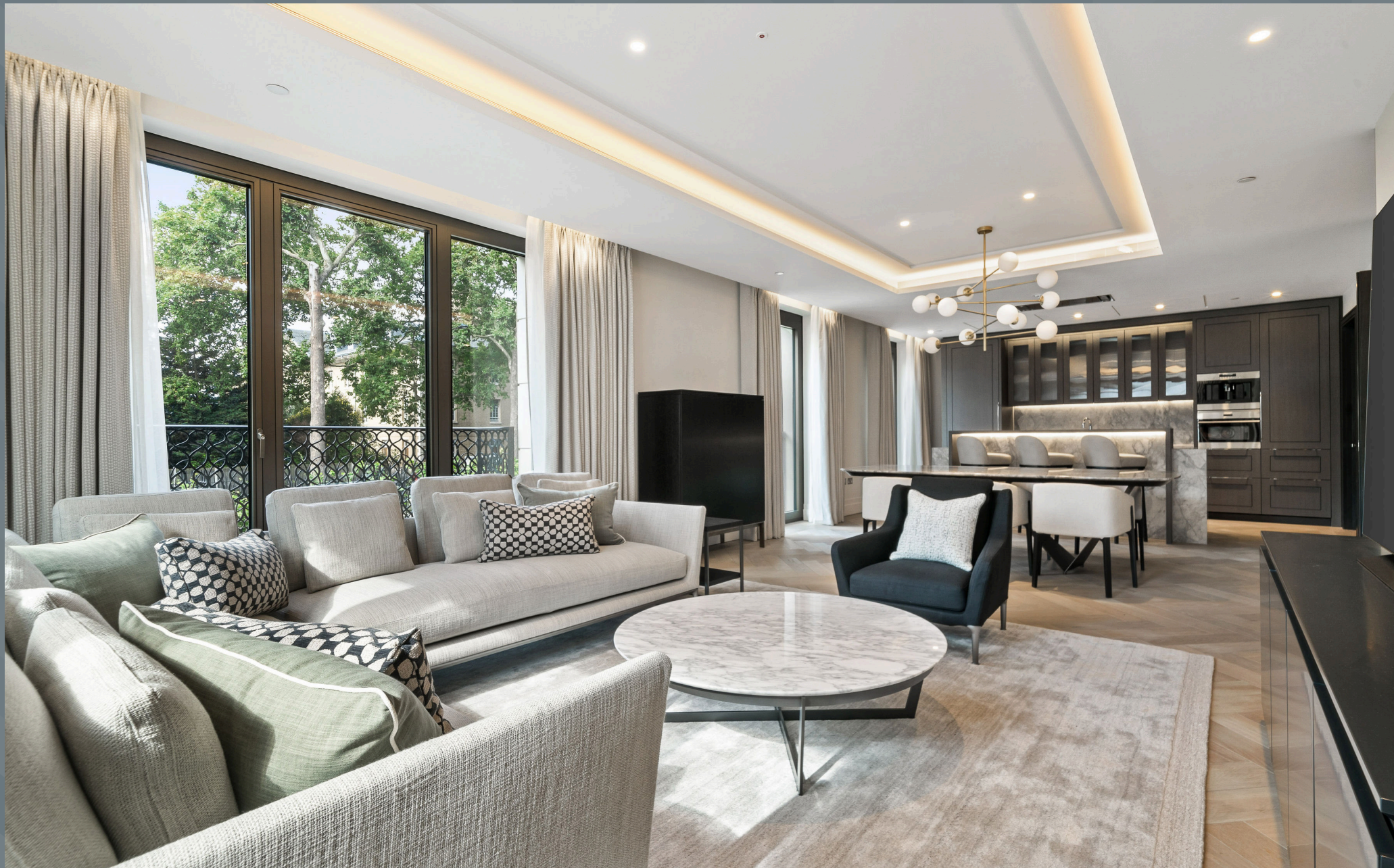
Mulberry Square CHELSEA BARRACKS SW1W