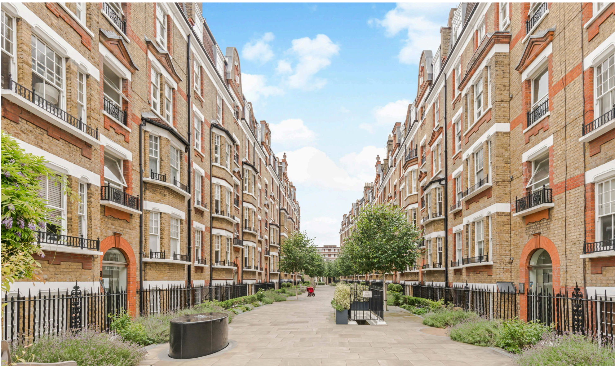
Walton Street, Chelsea, SW3