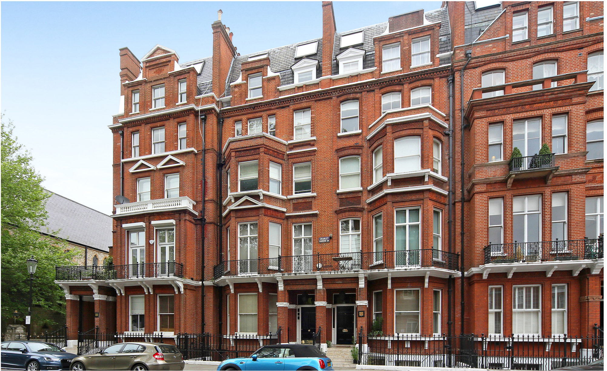
Cranley Gardens, South Kensington, SW7