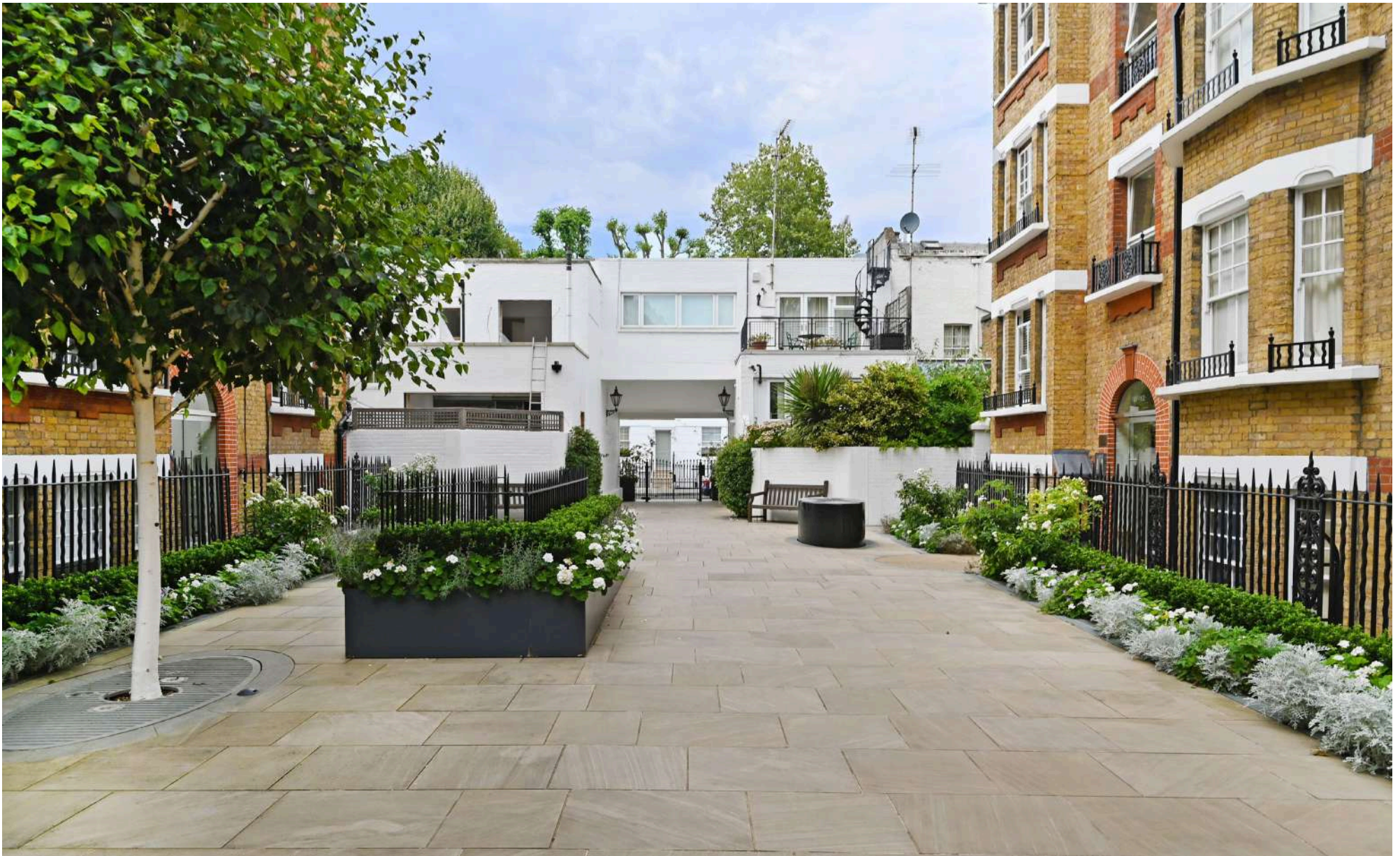
Walton Street, Chelsea, SW3