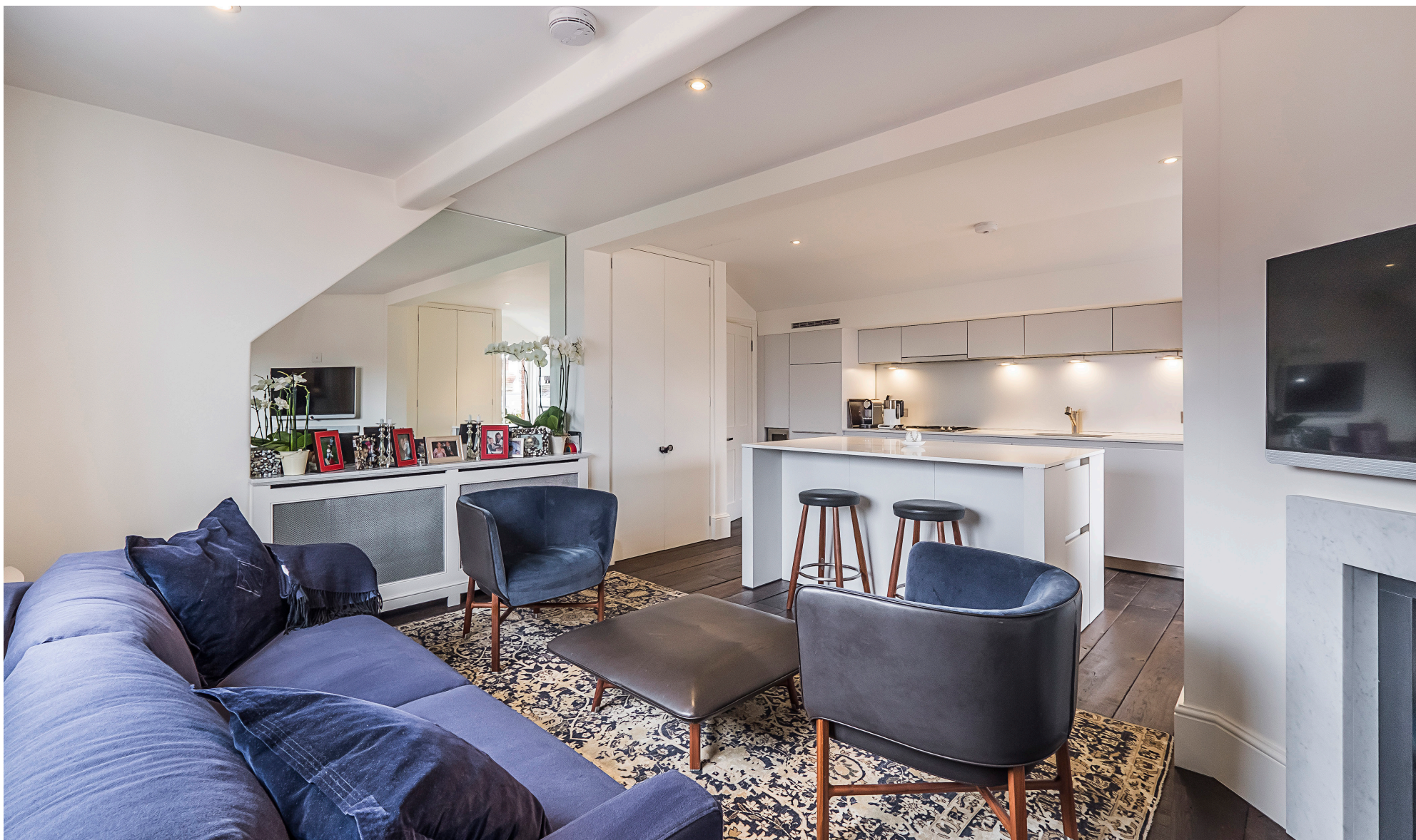
Cadogan Gardens Chelsea SW3