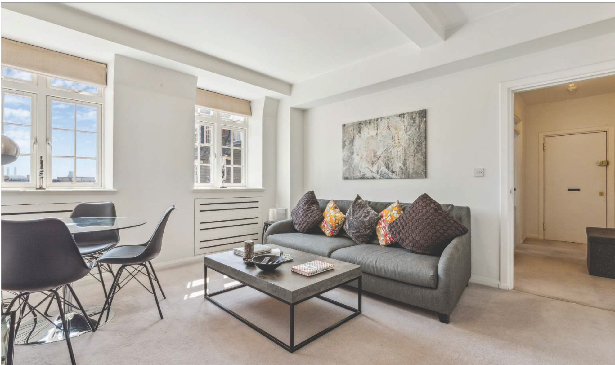
Cranmer Court Chelsea SW3