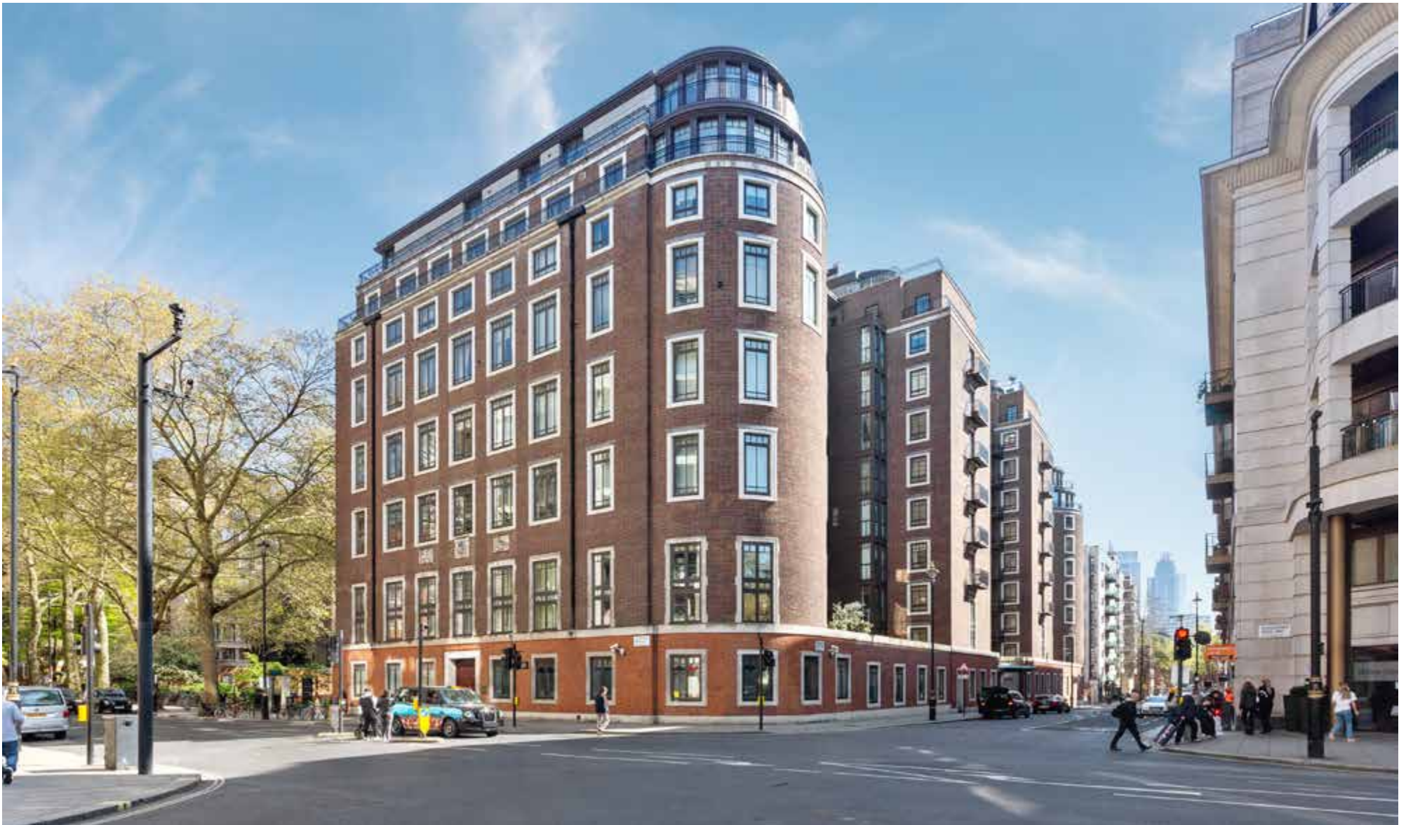
St Johns Building Marsham Street SW1P