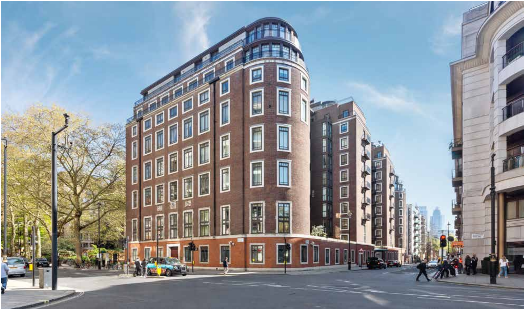
St Johns Building Marsham Street SW1P