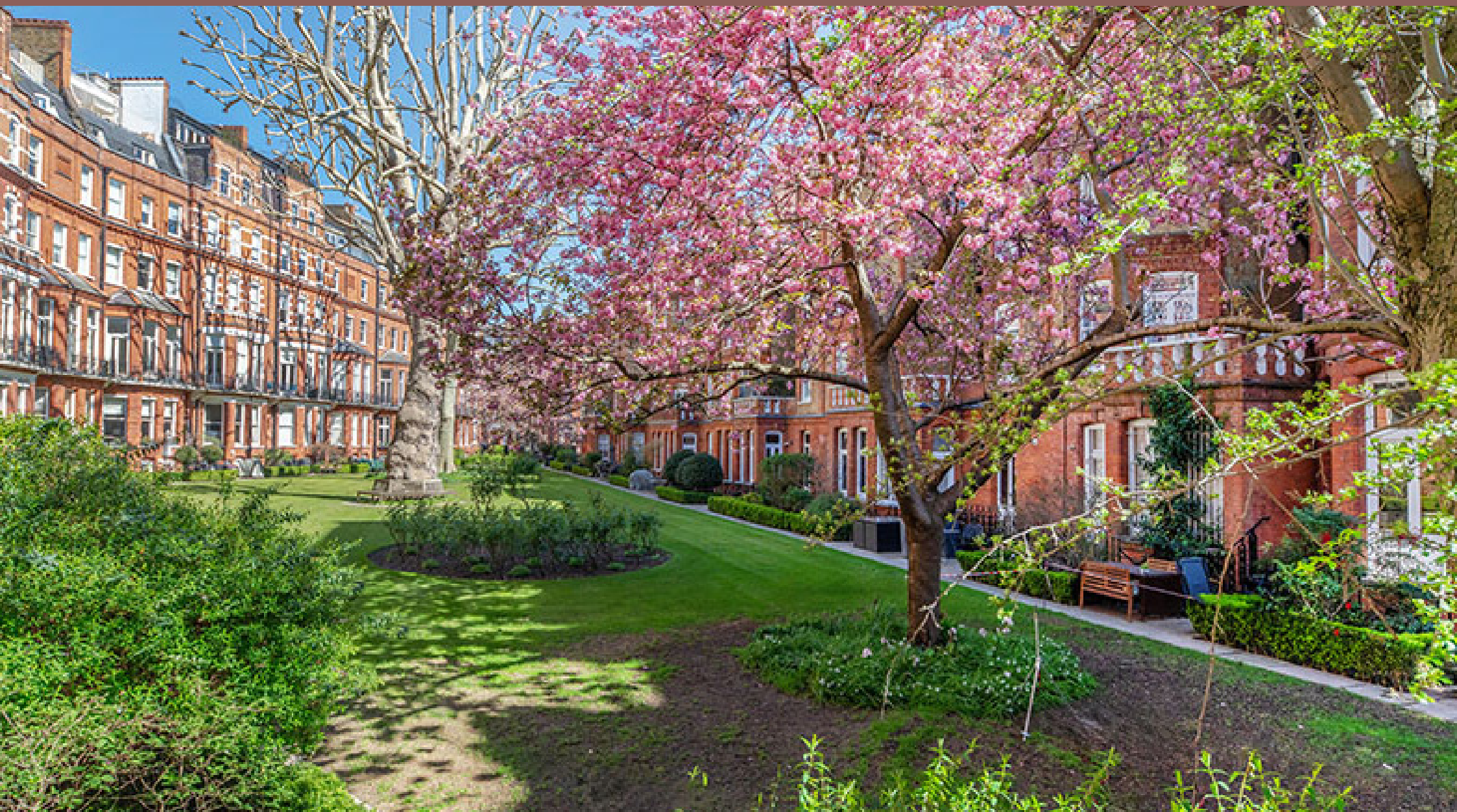
EGERTON GARDENS KNIGHTSBRIDGE SW3

A WELL PRESENTED RAISED GROUND FLOOR FLAT WITH DIRECT ACCESS ONTO COMMUNAL GARDENS.