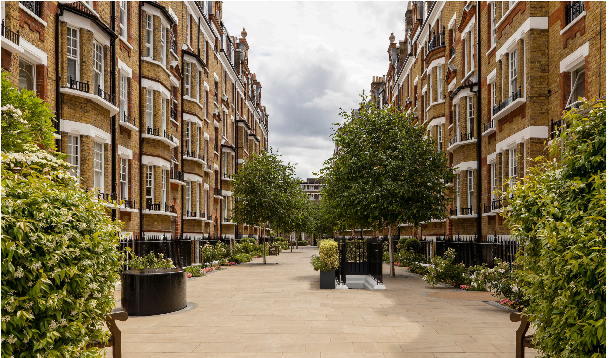
Walton Street Chelsea SW3