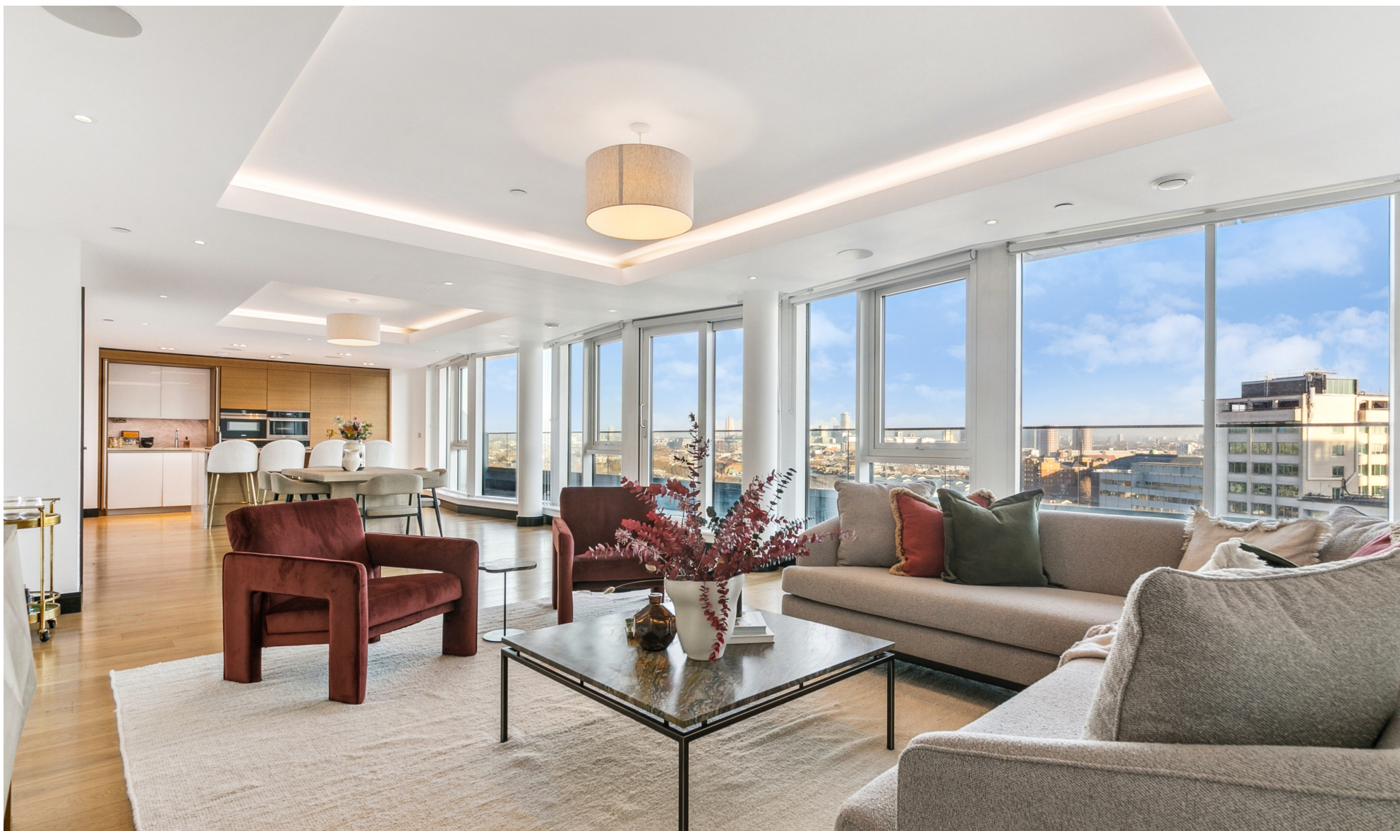
Lancaster House Hammersmith W6