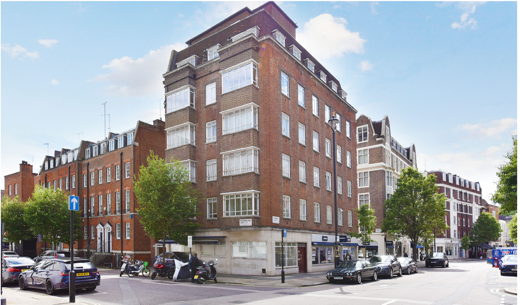
Wesley Court Paddington W2