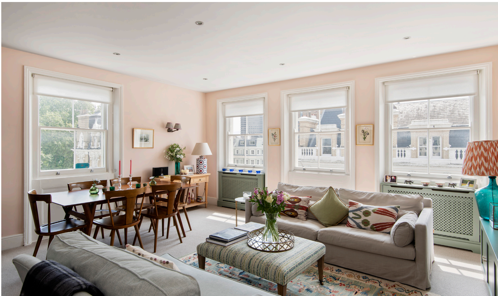
Cornwall Gardens Court South Kensington SW7