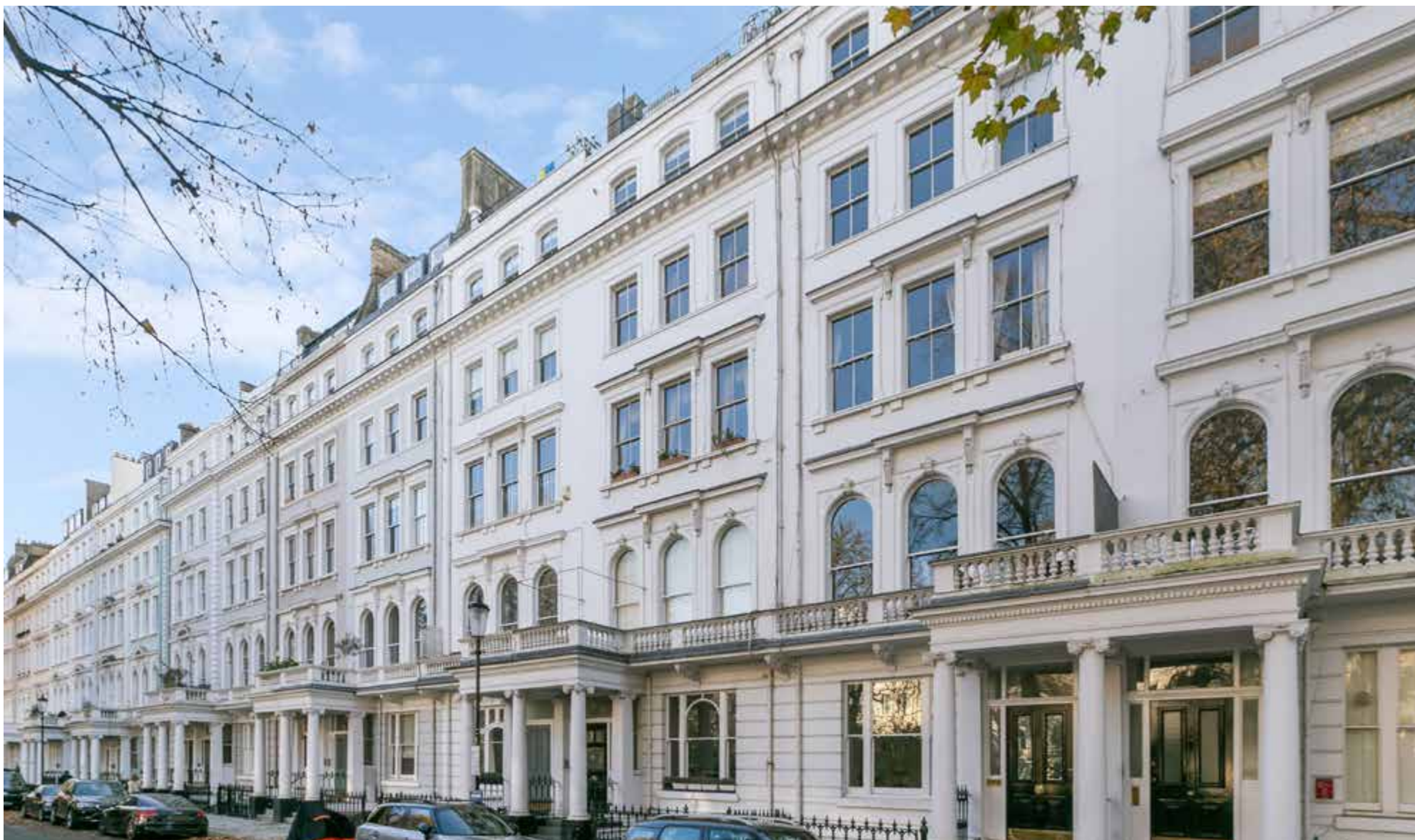
Cornwall Gardens South Kensington SW7