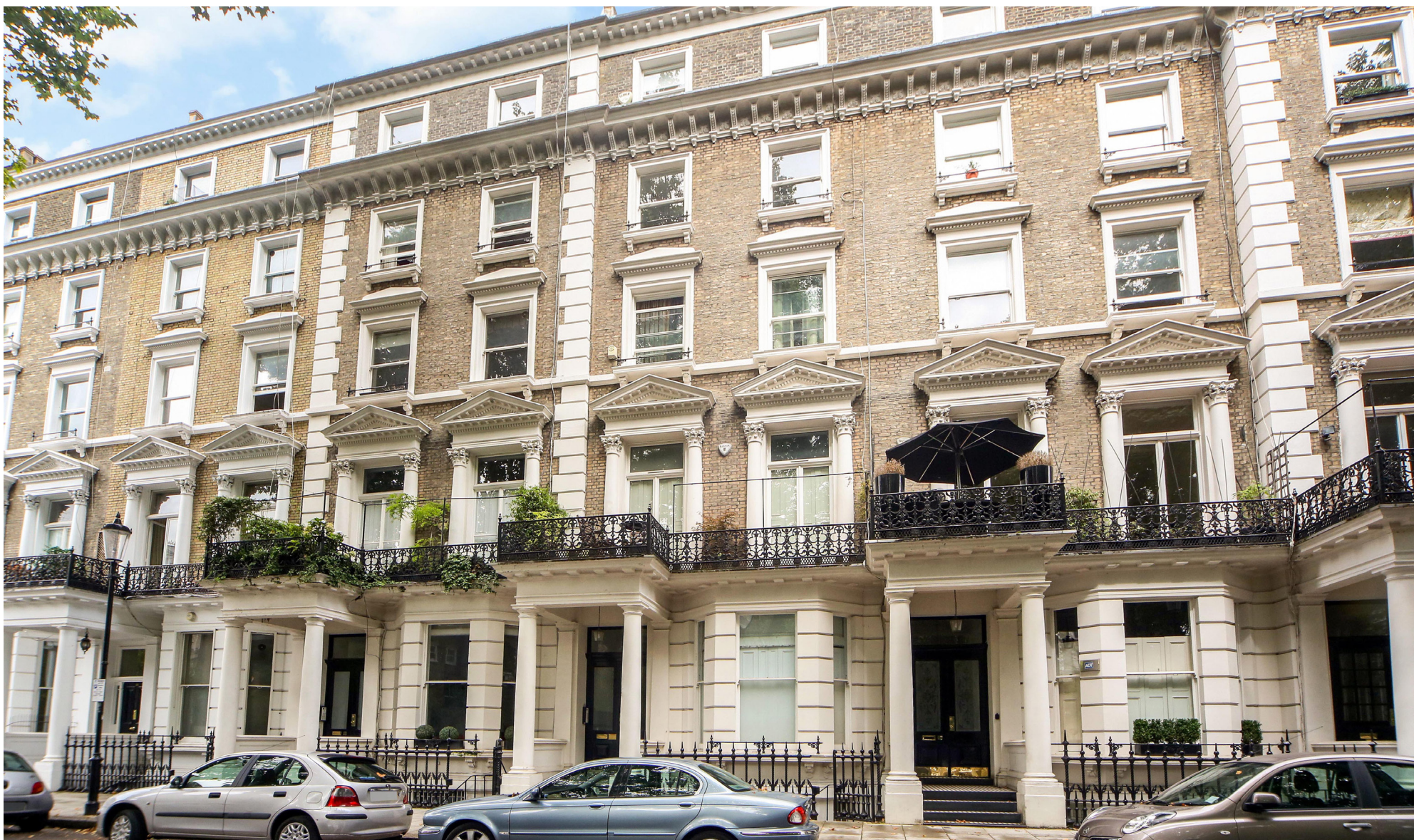
Courtfield Gardens South Kensington SW5