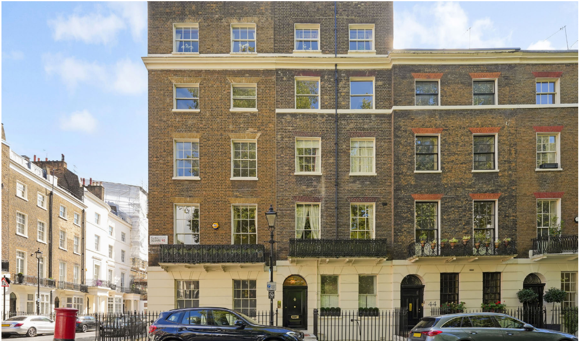
Connaught Square Westminster W2