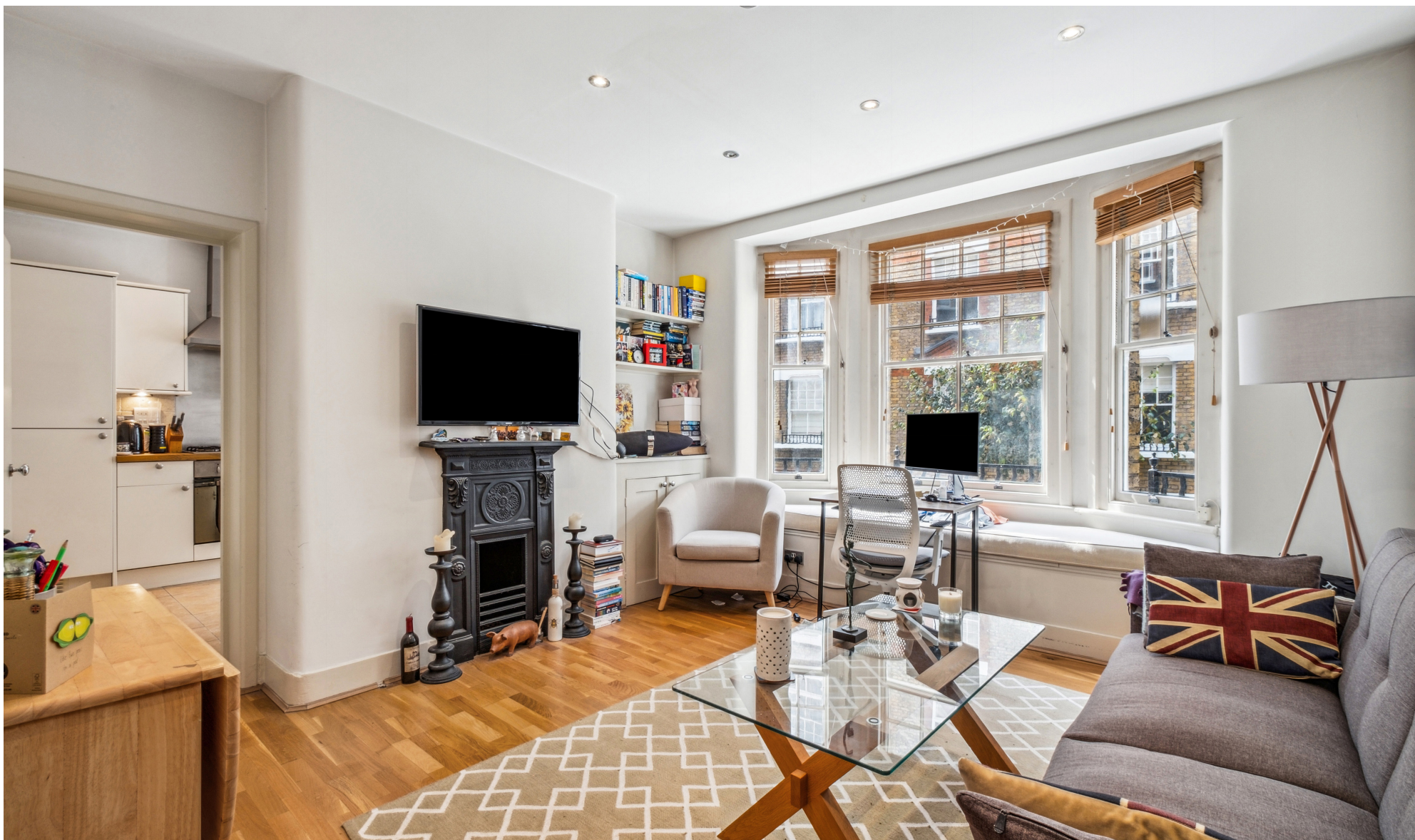
The Marlborough Walton Street SW3