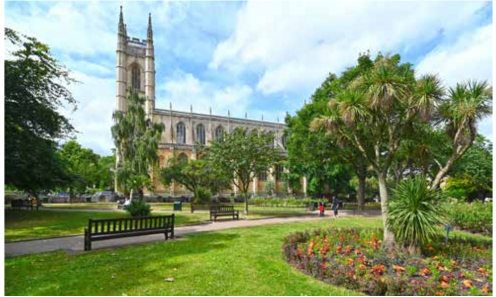
View from Reception Room

Britten Street is positioned to the north of the Kings Road and is within easy reach of Chelsea Green and all the world – class shops, bars and restaurants that the immediate area has to offer. South Kensington station (District, Circle and Piccadilly lines) is 0.5 miles away and Sloane Square station (District and Circle lines) is 0.7 miles away.