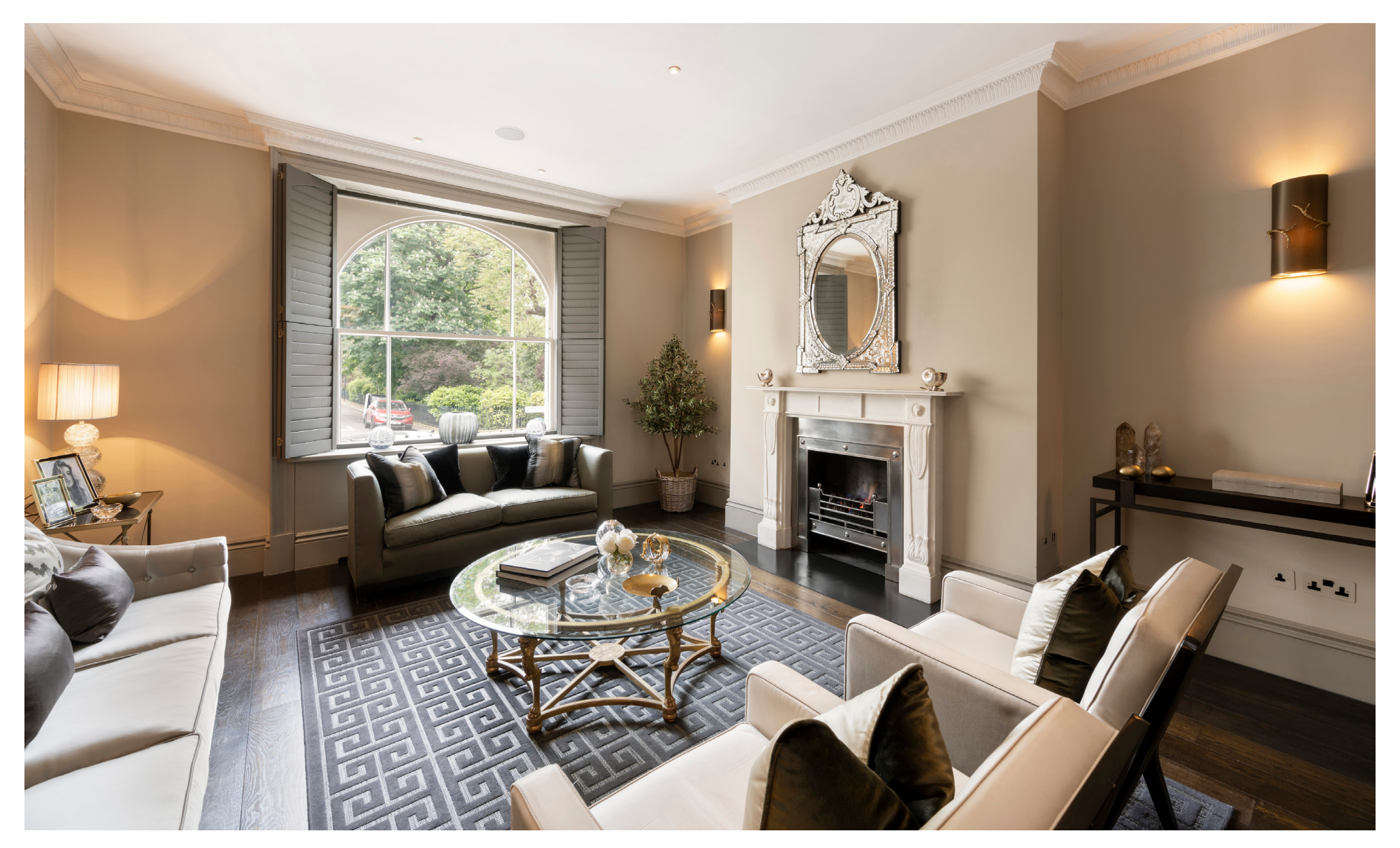
Renovated to an exacting standard, this is a rare and immaculately presented garden flat, located on one of the most prestigious garden squares in London.